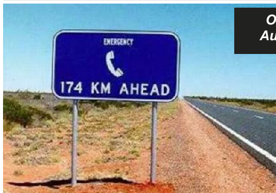
Only in Australia