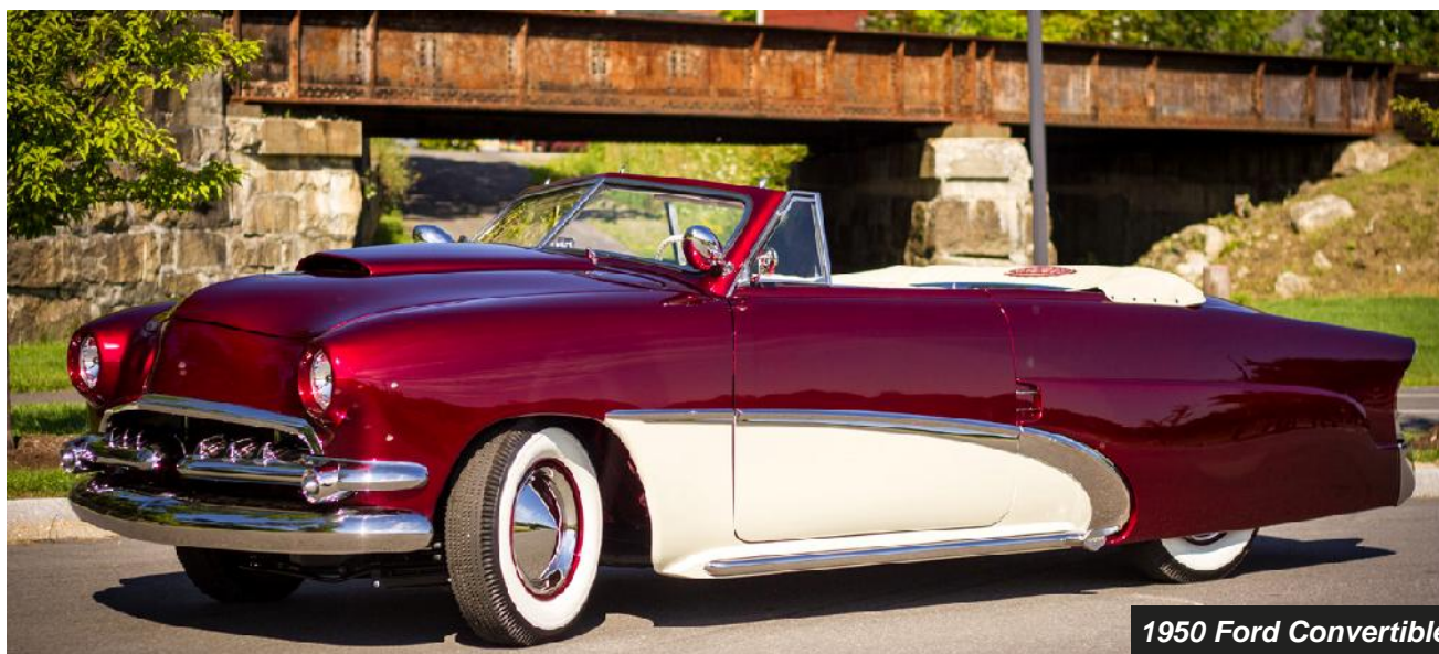
1950 Ford Convertible