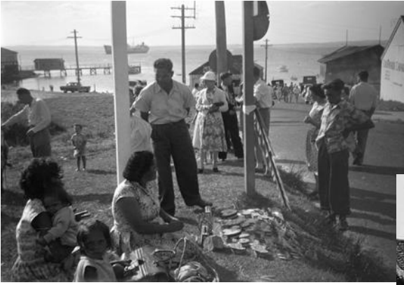
Selling boomerangs at The Loop - c1950s