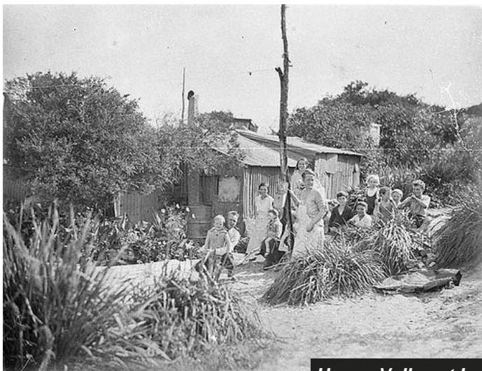
Happy Valley at La Perouse during 1930s depression years.