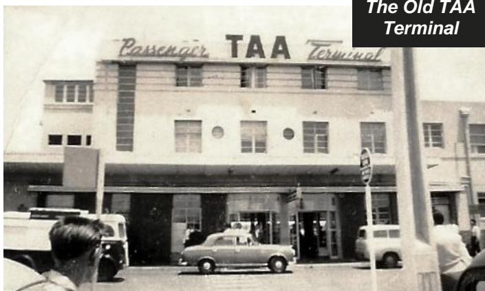
The Old TAA Terminal