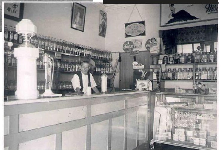
Mascot Milk Bar - 1948