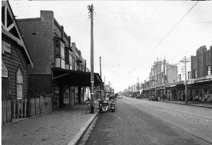
Botany Road Scene