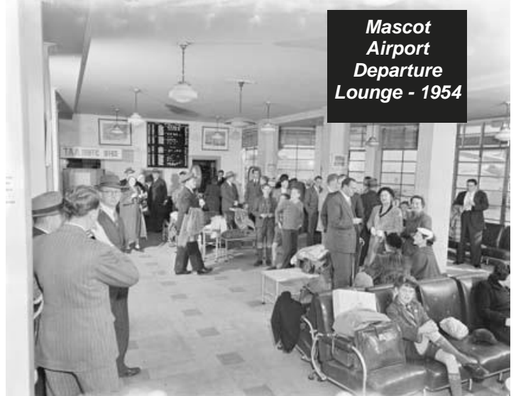
Mascot Airport Departure Lounge - 1954