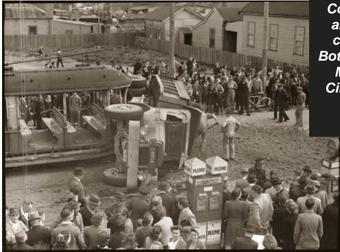
Coal truck and tram collide - Botany Road Mascot. Circa early 1940s