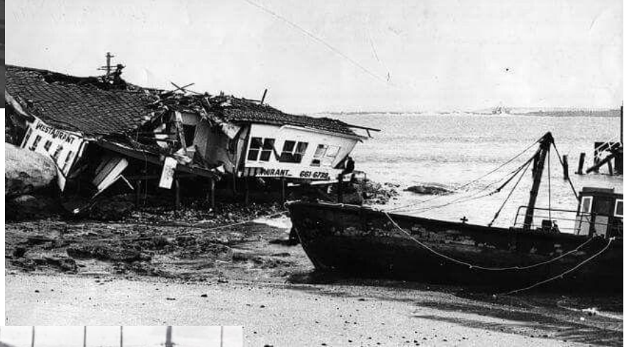
The wreck of the old Paragon Restaurant following the 1974 storm.