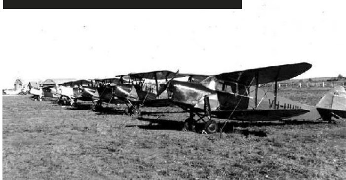
Royal Aero Club ,Mascot - 1948