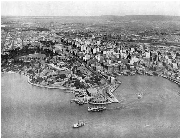
Benelong Point sans the Sydney Opera House.