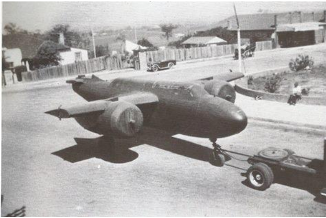
Not something you would see every day. A Boston Bomber,being towed to Richmond, passes the Windsor and Seven Hill Roads Intersection at Baulkham Hills in 1942.