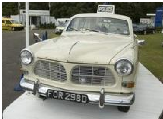
Then & Now