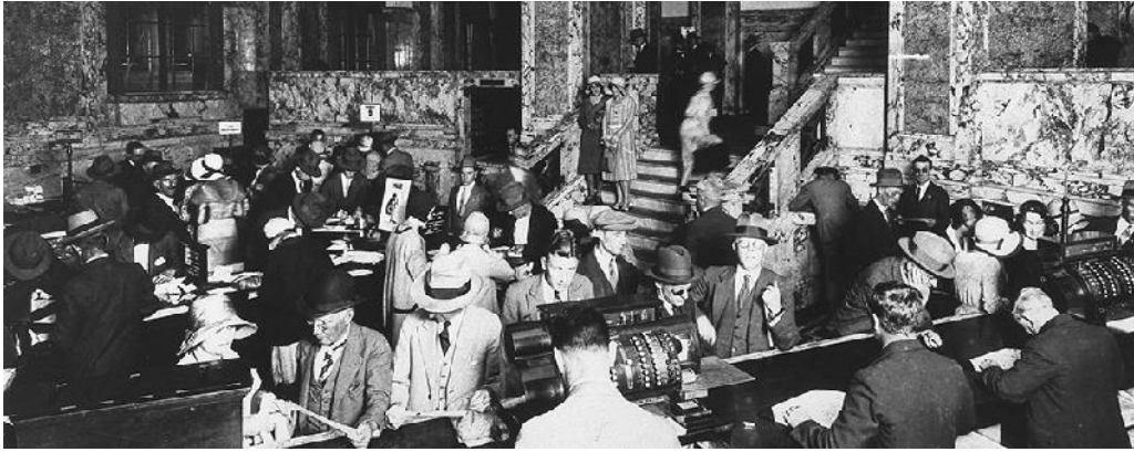
Reception at the Radisson Plaza Hotel in Sydney.....1930s?